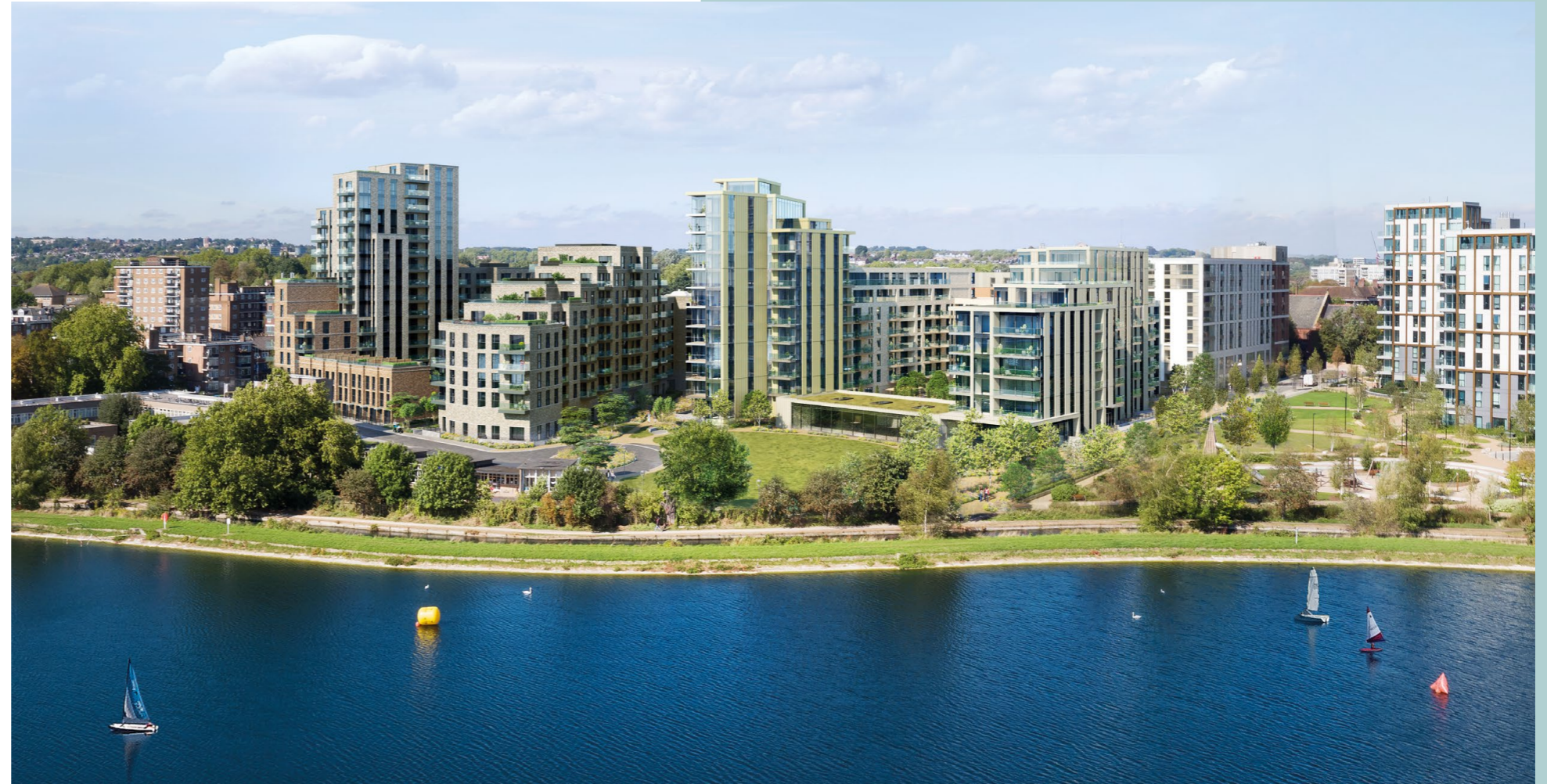
Computer Generated Image of Woodberry Down

This tranquil selection of new homes has been designed to be an oasis of calm. Outside, the peaceful courtyard garden has plenty of places to sit and relax, while each luxury apartment offers the finest in modern open-plan living, with high quality fixtures and fittings and a private outdoor space.