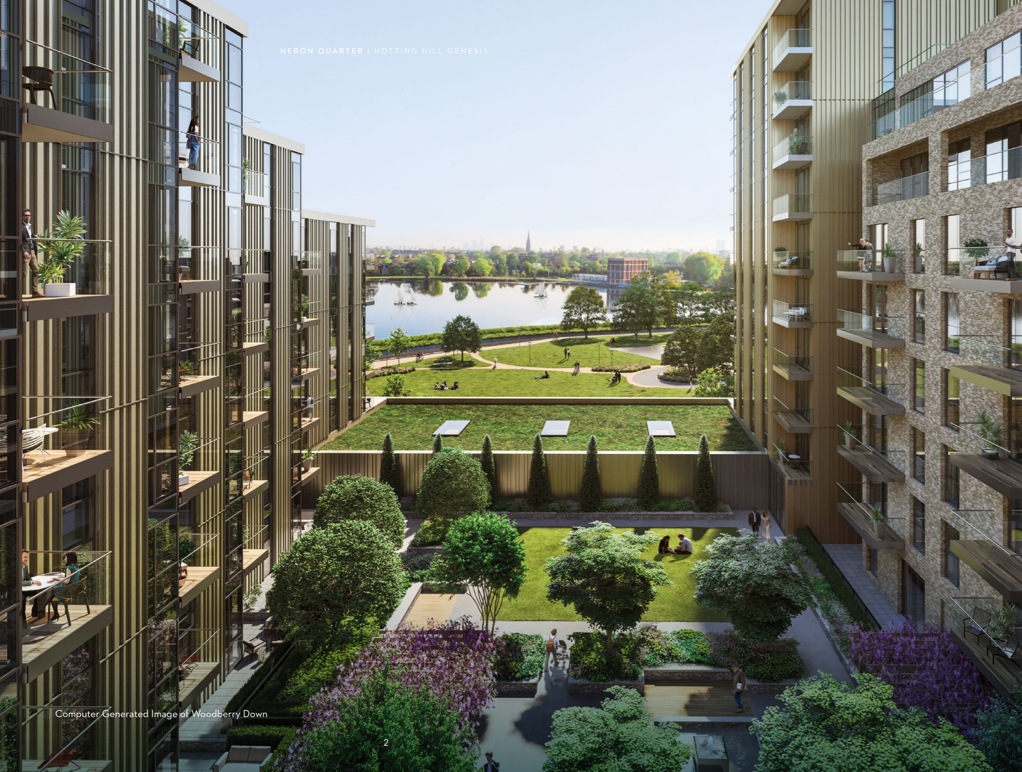
Computer Generated Image of Woodberry Down